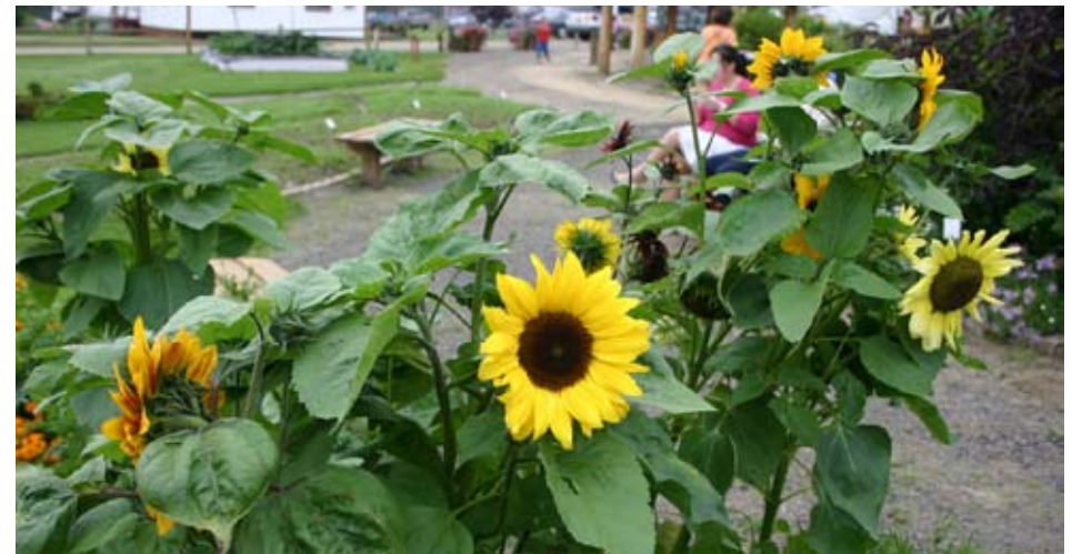
Helianthus annuus , or sunflowers, growing in the Georgeson Botanical Garden.

USDA Plant Introduction Stations, NC7, Iowa State Univ, Plants and seeds