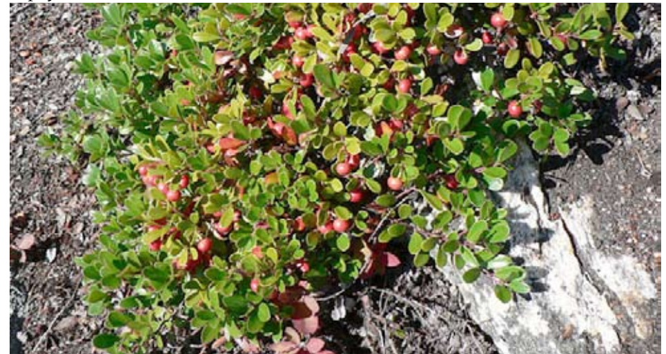
Arctostaphylos uva-ursi, or kinnikinnik.