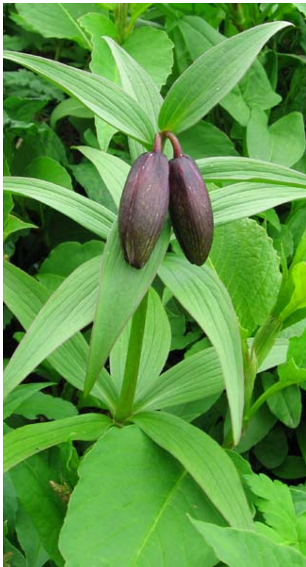
Fritillaria camschatcensis , or chocolate lily.

Bedstraw, Northern ( Galium boreale ) Cecily, Sweet ( Myrrhis odorata ) Cherry, European dwarf ( Prunus fruticosa ) Chives ( Allium schoenoprasum ) Chives, Chinese Garlic ( Allium tuberosum ) Chocolate Lily ( Fritillaria camschatcensis ) Costmary ( Tanacetum balsamita ) Crowberry ( Empetrum nigrum ) Currant, Black ( Ribes nigrum ) Gooseberry, red ( Ribes spp.) Kinnikinnik ( Arctostaphylos uva-ursi ) Lambs Quarter, Magentaspreen ( Chenopodium album ) Labrador Tea ( Ledum palustre ) Lemon Balm ( Melissa officinalis ) Lingonberry ( Vaccinium vitis-idaea ) Lovage ( Levisticum officinalis ) Mint ( Mentha spp.) Mountain Ash, Green's ( Sorbus scopulina ) Nettle, Stinging ( Urtica dioica ) Onion, Altai ( Allium altaicum ) Onion, Flat-leaved ( Allium senescens ) Onion, Welsh 'Gribovski' ( Allium fistulosum ) Parsley 'Hamburg Rooted' ( Petroselinum crispum ) Roseroot ( Rhodiola rosea ) Saskatoon ( Amelanchier alnifolia ) Shepherd's Purse ( Capsella bursa-pastoris ) Sorrel ( Rumex spp.) Sorrel, French ( Rumex scutatus ) Stinkweed ( Artemisia tilesii ) Sweet Cicely ( Myrrhis odorata ) Sweet Woodruff ( Galium odoratum )