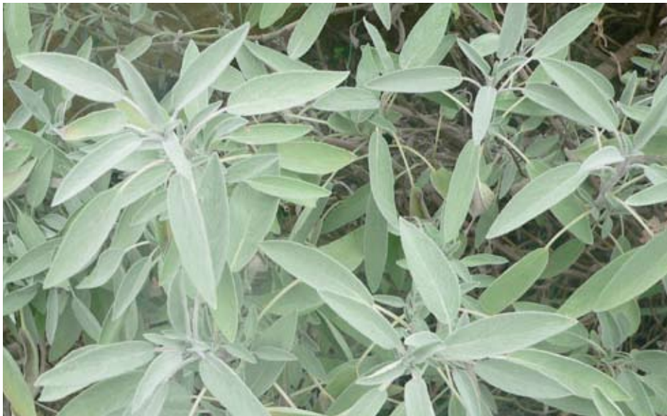
Salvia officinalis , or culinary sage.

Oregano, Syrian ( Origanum maru ) Parsley ( Petroselinum crispum ) Pepper ( Capsicum anuum ) Peppermint ( Mentha x piperita ) Rosemary ( Rosmarinus officinalis ) Rue ( Ruta graveolens ) Sage ( Salvia officinalis ) Sage, Cashmere ( Phlomis cashmeriana ) Sage, White ( Salvia apiana ) Santolina ( Santolina camaecyparissus ) Savory, Summer ( Satureja hortensis ) Sunflower ( Helianthus anuus ) Syrian Oregano ( Origanum maru ) Tansy ( Tanacetum vulgare ) Thyme, Creeping Lemon ( Thymus praecox ) Thyme, Lemon ( Thymus praecox articus ) Thyme, Minus ( Thymus praecox articus ) Vervain, Blue ( Verbena hastata ) Wormwood ( Artemisia absinthium )